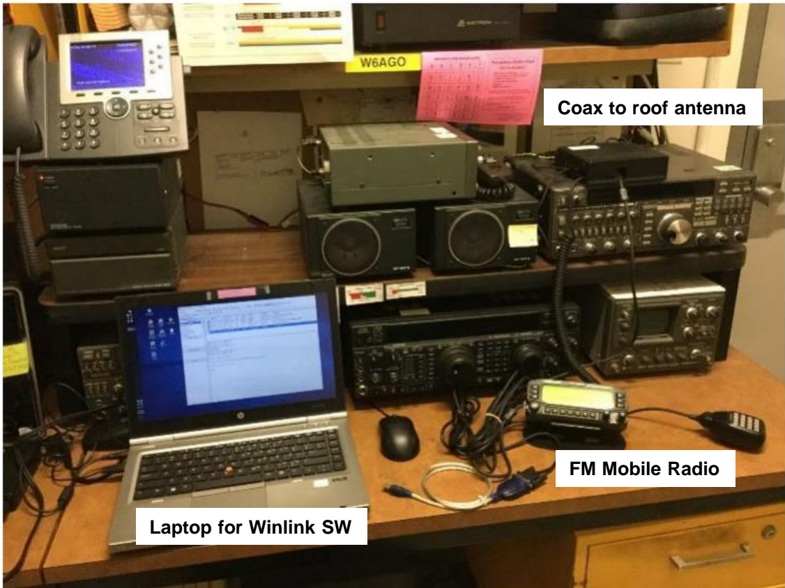
Laptop for Winlink SW